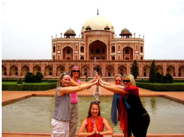
Humayans Tomb - Delhi

The morning is free to enjoy life along the river in Varanasi before we head to the airport for our flight to Delhi.