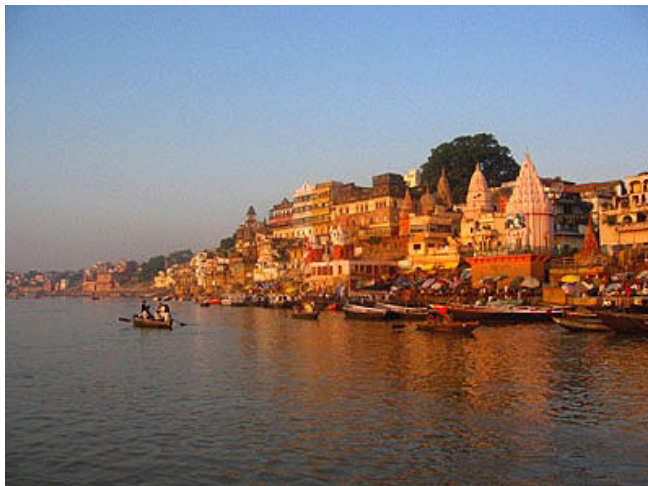
The holy city of Varanasi on the banks of the Ganges

After receiving enlightenment at Bodhgaya, The Buddha traveled to Sarnath, just on the outskirts of modern-day Varanasi to preach his first sermon. Since then, Sarnath has remained a major Buddhist site. We take the opportunity to visit the monasteries, ruins and temples of Sarnath.