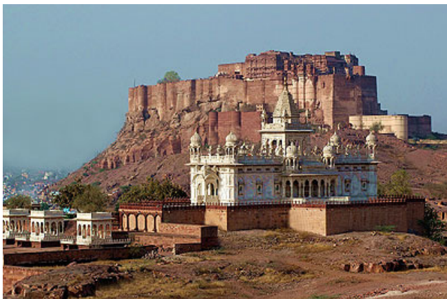
Meherangarh Fort - Jodhpur

Jodhpur is also famous for the creamy makhani (butter) lassi's (yogurt drink) which are found nowhere else in India. And yes, this is where the pants come from!