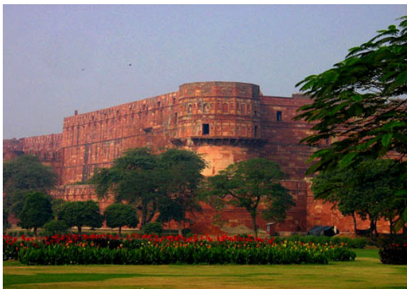
Red Fort - Agra

The icon of India, probably the most famous and beautiful building in the world, the majestic Taj Mahal surpasses all expectations and it truly is a wonder of the world, if not the greatest ever testimony to love. There are opportunities to visit it at different times of the day to see how its colour changes with the light.