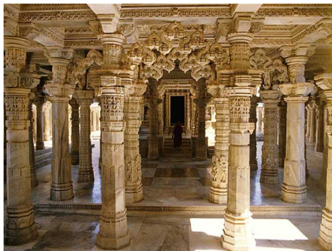
Dilwara Jain Temples Interior

We take time to marvel at the stunning marble carvings on the inside of the temple which were created over several centuries and also have time to wander around the lake, trek through the hills, hike to hill-top temples and enjoy the carnival-like atmosphere of the town which attracts a lot of Indian holidaymakers, although few international tourists make it here.