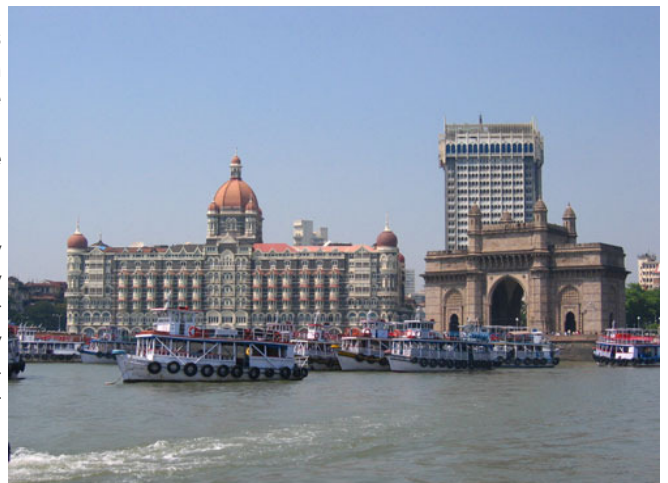
Taj Hotel and Gateway of India - Mumbai

Mumbai is also India's entertainment capital, and the home of Bollywood, so if you're lucky you might bump into a star, a film shoot on the streets or even get offered a part as an extra in a Bollywood extravaganza.