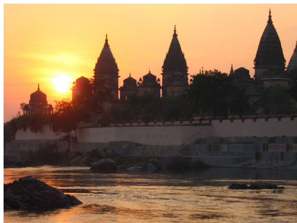
Betwa River Cenotaphs, Orchha

On the evening of day 18, we board our train for an overnight journey by 2-tier air-conditioned sleeper to Varanasi.