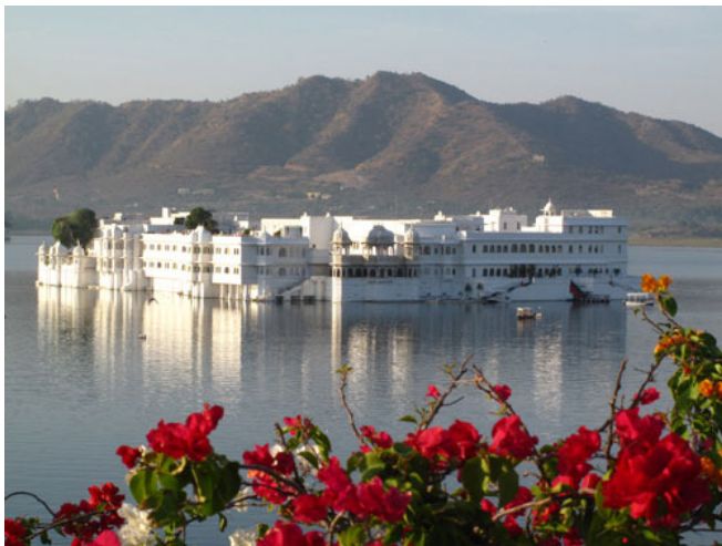
Lake Palace Hotel - Udaipur

We take a morning flight to Udaipur, which without questions lives up to its reputation as India's most romantic city. Rolling hills, white marble palaces and lakes all combine to give Udaipur a very special appeal. It's a centre for artists, dancers and musicians and the shopping is superb. Its other claim to fame is as the setting for James Bond's Octopussy.