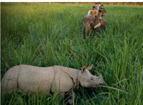
Chitwan National Park

Two amazing days of exploration await you.