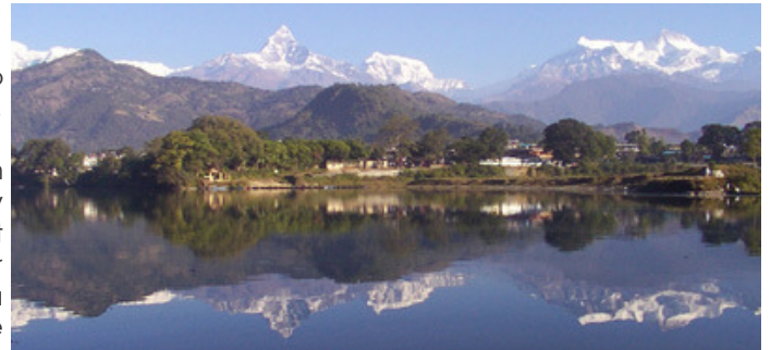
Phewa Lake Pokhara - Annapurna Range behind

However, Pokhara is more famous for its picturesque lakeside location and its close proximity to the Annapurna mountain range. A decidedly touristy town, Pokhara is still small, charming and very laid back. At just under 900m altitude, the weather in Pokhara is balmy and just right for sitting relaxing in a lakeside café or taking a boat out on the lake. If you feel up to a pre-trek warm-up, start the day with a dawn walk up to the nearby hill of Sarangkot for stunning view of the nearby Annapurna range.